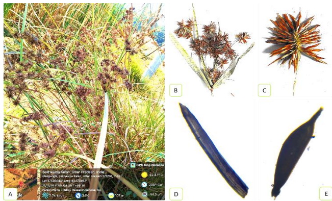
Plate No. 1: Cyperus odoratus L., A: Habitat, B: Inflorescence, C: Spikelet, D: Glume, E: Achene

(L.) S. S. Hooper, Kew Bull. 26: 579 (1972).